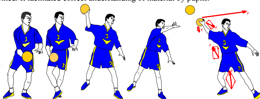
Fig.2. Fragments of educational cartoon: rules of forces addition by vectors when throwing [7]

This material is presented as educational film (cartoon), in which materials of geometry, physics, biology and physical culture are combined. It facilitated correct understanding of material by pupils.